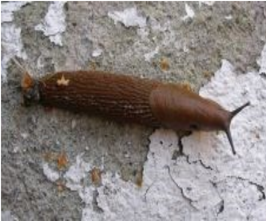
Photo: Arion lusitanicus

The report offers knowledge on alien introductions and recommendations for prioritising future management of Invasive Alien Species